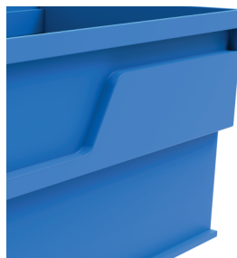
QUICK IDENTIFICATION ID card space