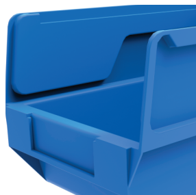
EASY ACCESS TO PRODUCTS Front with opening for access to products.