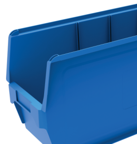
IDEAL FOR STORAGE Specially designed for warehouses where cleat is done manually and constantly.